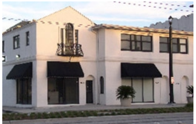
Inman Gallery at 3901 Main Street