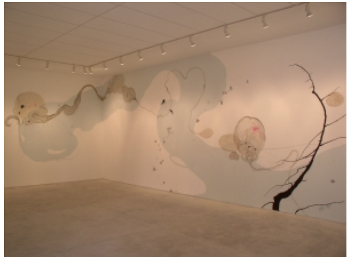
chimera - site specific mural by Darren Waterston